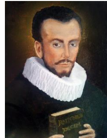
St. Edmund Campion 7CAM