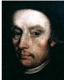
St. Edmund Arrowsmith 7ARW

When you arrive at Cardinal Pole, you will be given a Tutor Group, which you will remain with throughout your time at the school and named after one of our Martyr's below.