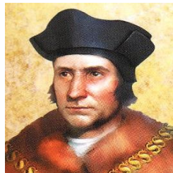
St. Thomas More 7MRE