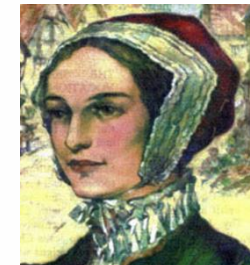
St. Margaret Ward 7WRD