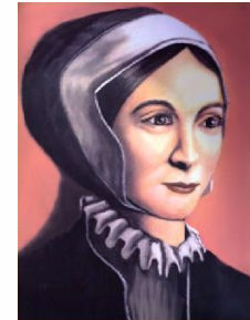
St. Margaret Clitherow 7CTW