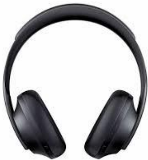
Headphones or Sound Turned On