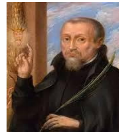
St. Robert Southwell 7SWL