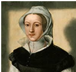
St. Anne Line 7LIN