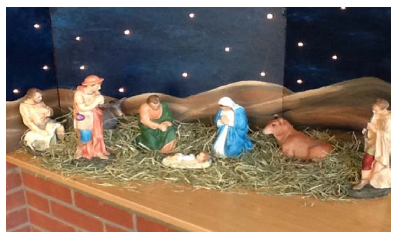
Nativity scene from main reception at Cardinal Pole