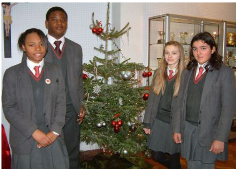
The four lucky students that attended the