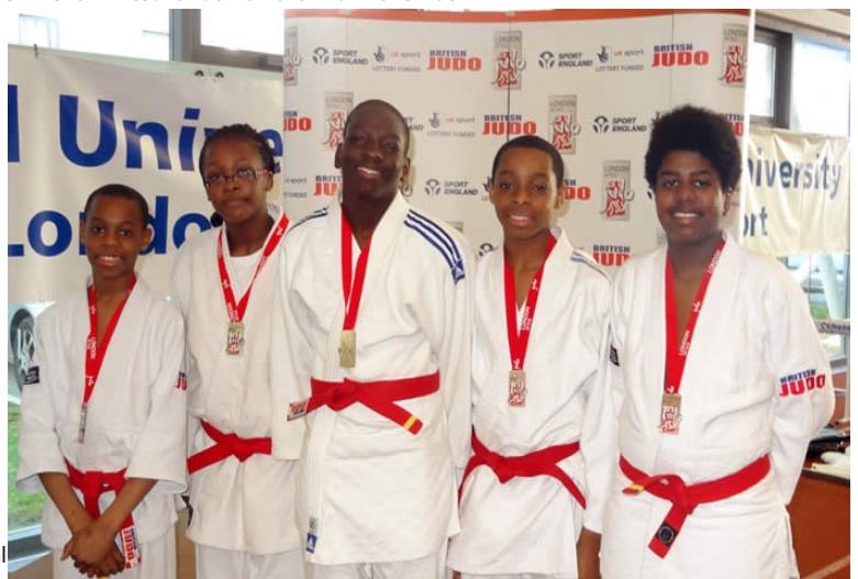
Well done to all our medal winners!