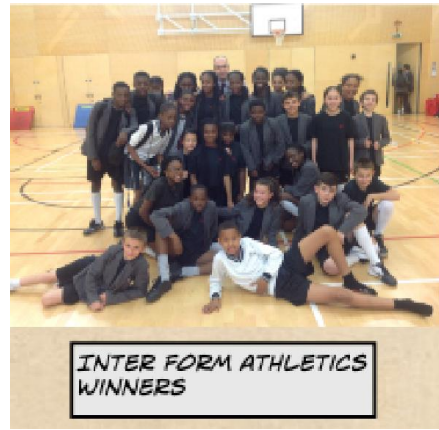
INTER FORM ATHLETICS WINNERS